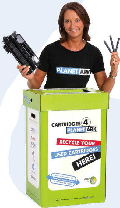
'Cartridges 4 Planet Ark' ambassador Layne Beachely.

MobileMuster , as the official recycling program of the Australian Mobile Telecommunications Association, also represents a voluntary responsibility program. It provides consumers with an extensive recycling network including all most mobile retailers, all Australia Post outlets, schools, workplaces and councils. There were 52,327 visits to the mobile pages, consistent with last year.