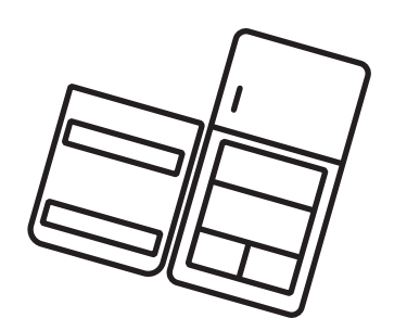
Becomes fridges and other items