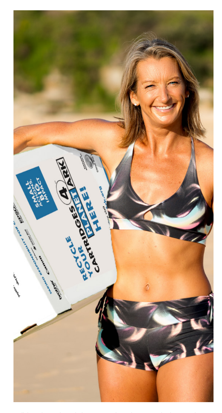
Collaboration with workplaces, councils, and communities have made Cartridges 4 Planet Ark the success it is today!

Printer cartridges are one of the many examples of how used products can be repurposed without having to send any waste to landfill and thus reducing our reliance on finite resources. By encouraging stakeholders along the entire supply chain, from manufacturers to consumers, to continue their commitment towards sustainable solutions, we hope to change the way people think about product circularity and recyclability