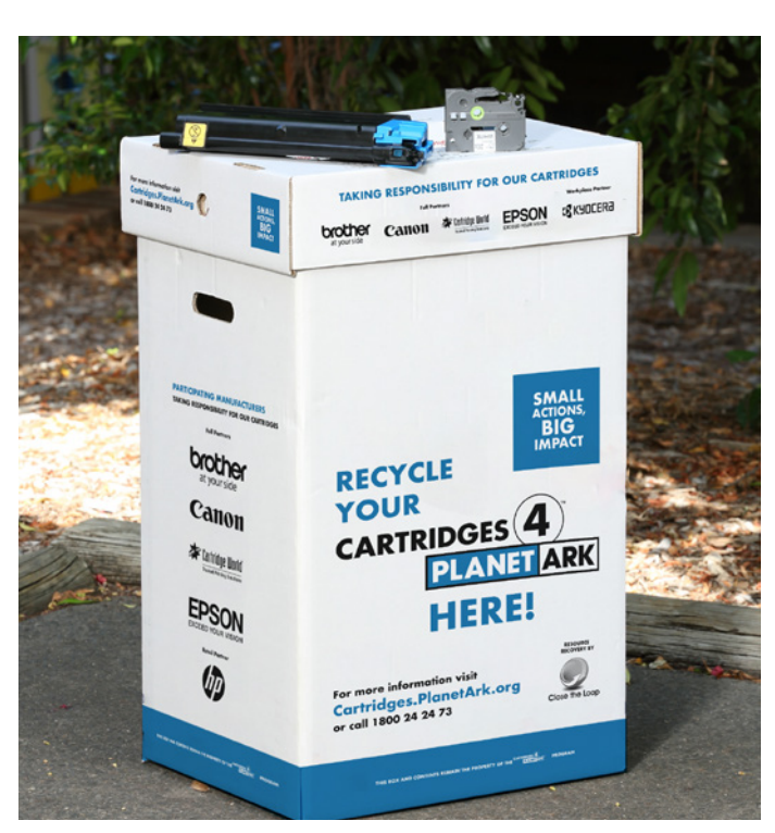
There are thousands of Cartrdges 4 Planet Ark return boxes in offices, retialers, schools, and universities around Australia.

One of the main benefits of this kind of resource management scheme is that they are often free to consumers! They are great opportunities to make recycling convenient and accessible to consumers and whilst also committing to sustainable business practices.